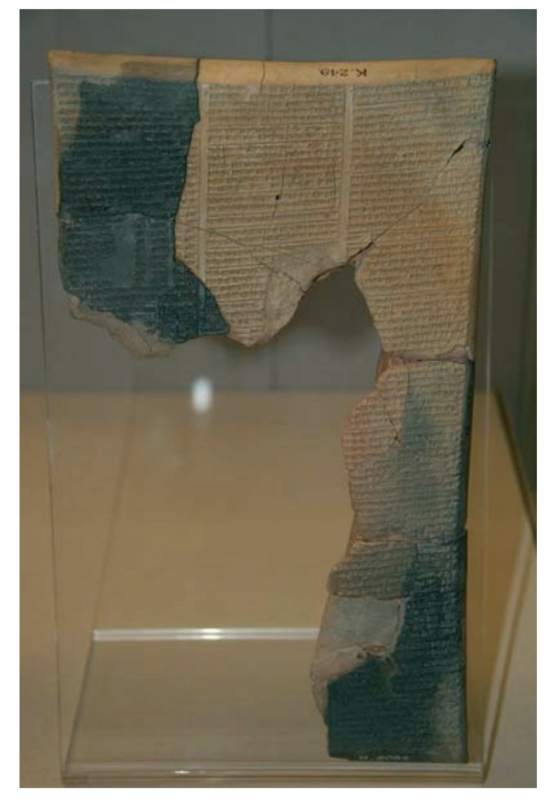
Fig. 6. Cuneiform clay tablet from the library of Ashurbanipal, Ancient Assyria

further borne out by the Persian gargarinj, Cannabis sativa, L. (the - nj is a frequent termination). GAN.ZI.GUN.NU is one of the most interesting words in cuneiform; we have already seen that GAN.ZI.SAR is kanasu, a narcotic "like mandragora", presumably opium; GUN.NU is the equivalent of some form of burrumu, originally apparently 'to twist, weave' as well as 'to be two-coloured'. Consequently the word = GAN.ZI + 'weave', i.e., the weaving narcotic, and there is great philological similarity between this and the Hindustani ganjha (cannabis), [...].