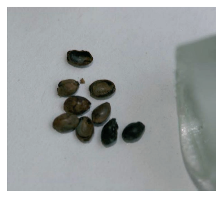
Fig. 8. Seeds of Scythian cannabis from Pazyryk, Siberia, Russia

These same Scythians were notable horsemen who traveled and traded widely between China, the Middle East, and Eastern Europe. Physical evidence of their use of cannabis has been unearthed [169][170]. The 'Frozen Tombs' of Pazyryk, dated to the 5th-3rd centuries B.C., were excavated earlier the 20th century in the Altai Mountains of Siberia. Artamonov (1965) recovered a small tent and a copper censer containing burned hemp seeds, felt to be utilized much as in the ritual Herodotus described. Rudenko (1970) also described a leather flask containing hemp seeds, and asserted that smoking of cannabis occurred in everyday life, and not merely as a funerary rite. These seeds ( Fig. 8 ) are quite tiny and marbled, consistent with observations by Vavilov for wild cannabis strains [53], and recent agronomic analysis [41].