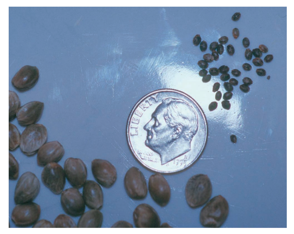
Fig. 1. Seed-size variation in cannabis. Seeds at right are a feral plant in Kashmir (800 seeds/g) and those at left are culinary seeds from China (15 seeds/g) (see text for details; photo E. B. R. , from collection of David Watson, HortaPharm BV , Amsterdam).

Phytocannabinoids [2] are unique to cannabis, and number some 66-odd molecules [3]. Tetrahydrocannabinol (THC) is the predominant psychoactive cannabinoid, and has partial agonist activity at cannabinoid receptors CB_1 and CB_2 . Its metabolic breakdown product, cannabinol (CBN), also has modest psychoactive effects, while other representatives have their own unique attributes (reviewed in [4]). Whereas cannabinoid-like structures have been reported from the New Zealand liverwort, Radula marginata [5], no actual biochemical activity at cannabinoid receptors has been reported to date. Recently, modulation of tissue necrosis factor alpha (TNF- \alpha ) in Echinacea spp. extracts was demonstrated to occur via CB<sub>2</sub> receptors [6].