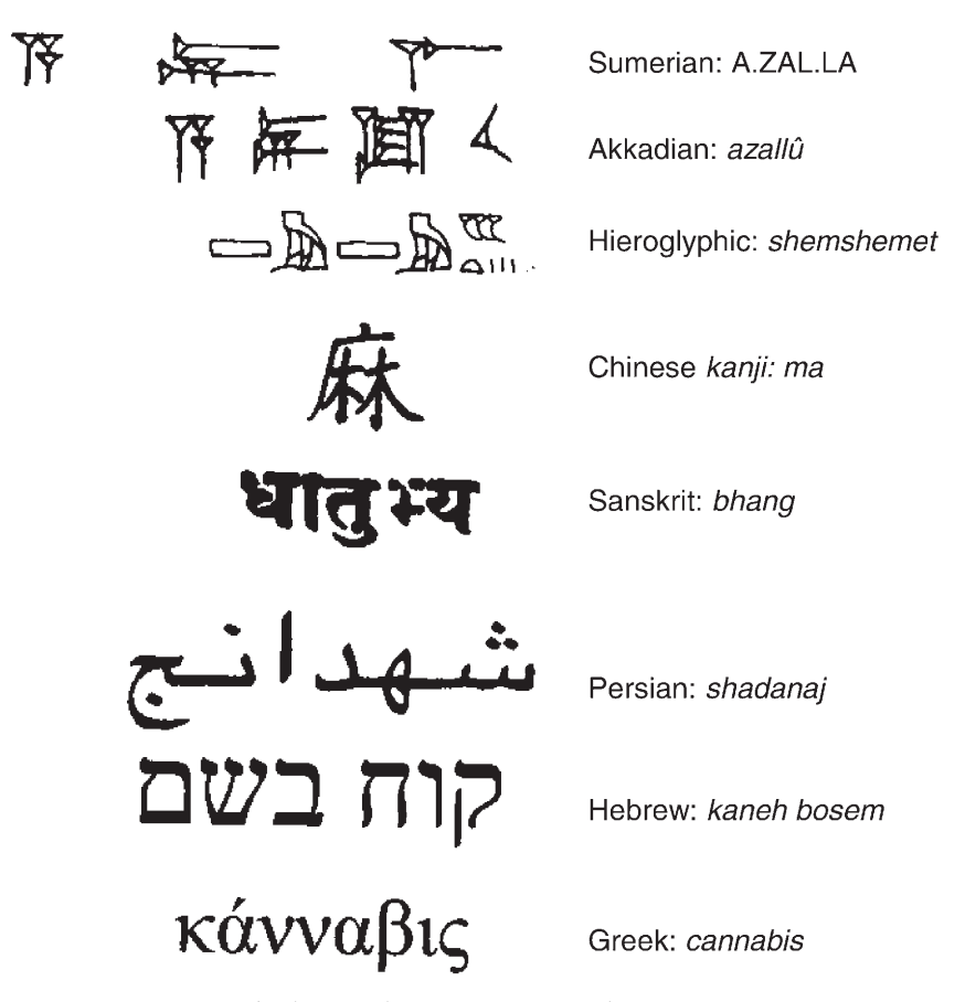
Fig. 5. Cannabis in various ancient languages

The antibacterial effects of honey are well-known, but less attention has been paid of late to the antibiotic effects of cannabis and its components [86], antihelminthic activity prominently described in the later Arabic literature [87], or insecticidal potential [4][14]. These reported vermicidal properties of cannabis thus may have predated Galen 's reports [88][89] by 1700 years!