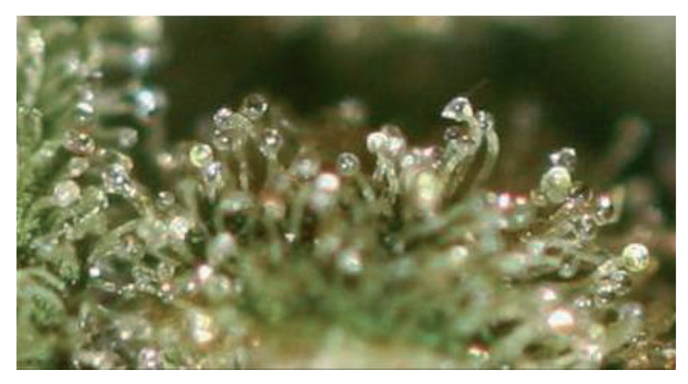
Fig. 3. Cannabis glandular trichomes in vivo

complicate the picture, certain cannabis strains are capable of utilizing a different precursor than olivetol, namely 4-carboxy-5-propylresorcinol ( Raphael Mechoulam , personal communication, 2005), to form the propyl phytocannabinoids: cannabigivarin (CBGV), tetrahydrocannabivarin (THCV), cannabidivarin (CBDV), and cannabichromivarin (CBCV) after decarboxylation. Lest anyone think this fact a bit of biochemical irrelevancy, these previously little studied variants may be of considerable pharmaceutical importance, as THCV was recently demonstrated to be a potent antagonist at cannabinoid receptors CB_1 and CB_2 [39]. The maturation of Mendelian genetic techniques has produced a modern revolution in the potential for creative medical cannabis phytochemistry that may be applied to various biochemical targets.