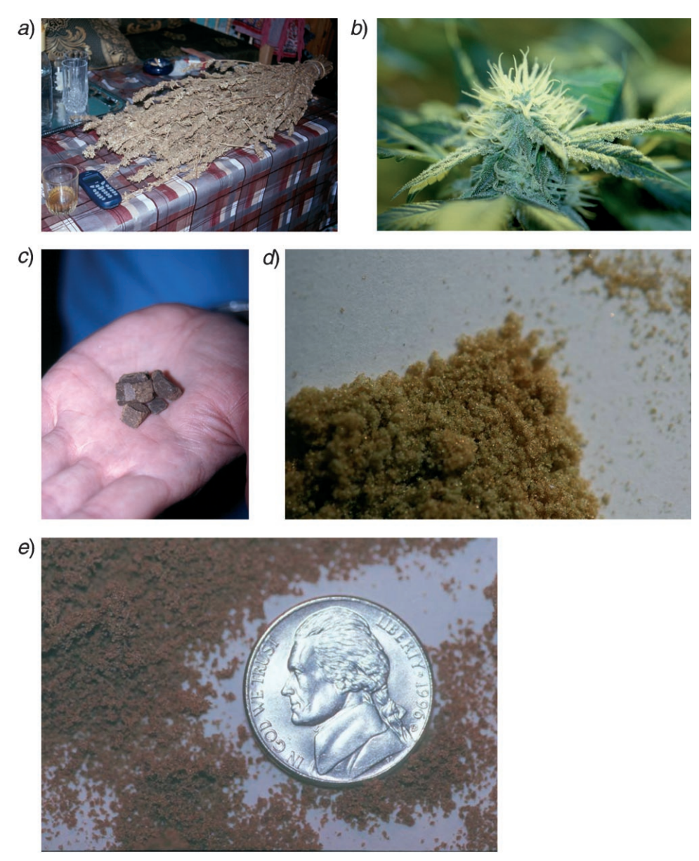
Fig. 4. Cannabis forms. a) Bhang , or unmanicured herbal cannabis, Rif Mountains, Morocco; b) ganja or sinsemilla, (photo E. B. R., Hash, Marihuana and Hemp Museum, Amsterdam); c) charas, or hashish, 'soapbar' from Morocco, as encountered in the UK; d) sifted hashish, Amsterdam; e) water hash, Amsterdam.

5. History of Medicinal Cannabis. -5.1. Egypt. Egypt is universally recognized as one of the great early civilizations, with an advanced medical system. In prior generations, most authorities have claimed an absence of definitive evidence of