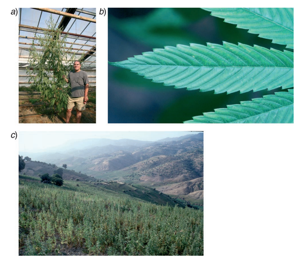
Fig. 2. Plant examples. a) Sativa type form, but indica genetics ( E. B. R. , HortaPharm BV ); b ) indica type, broadleaf ( E. B. R. , HortaPharm BV ); c ) ruderalis -type form, Rif Mountains, Morocco.